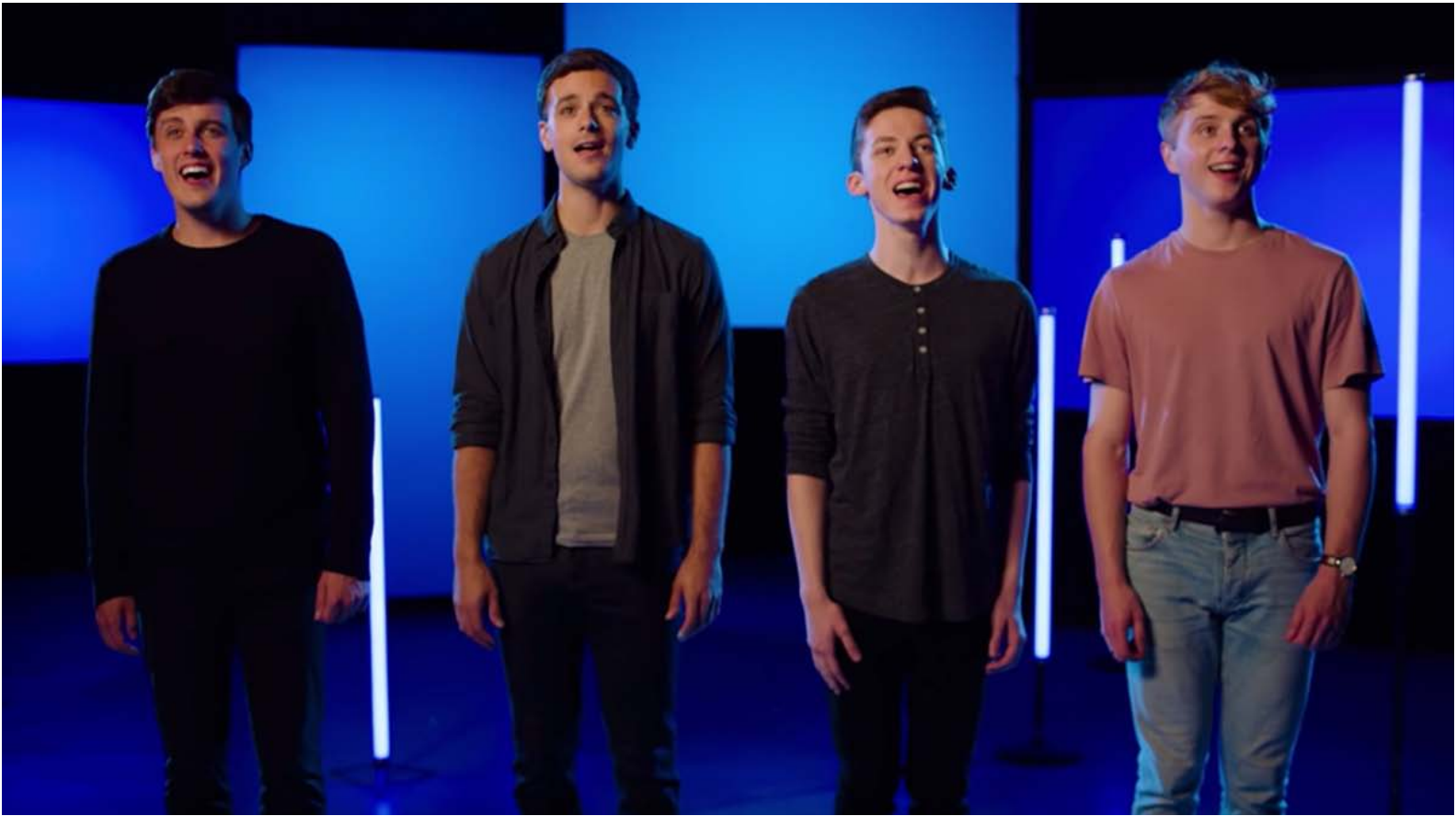
Listen Now: “For Forever” from Dear Evan Hansen